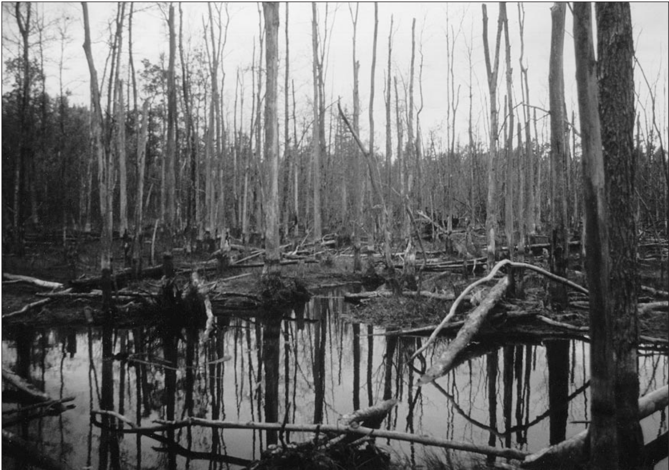
Beaver ponds provide excellent wetland habitat for wildlife.

separate from their dams, is deep enough to allow them to move freely under the ice in the winter.